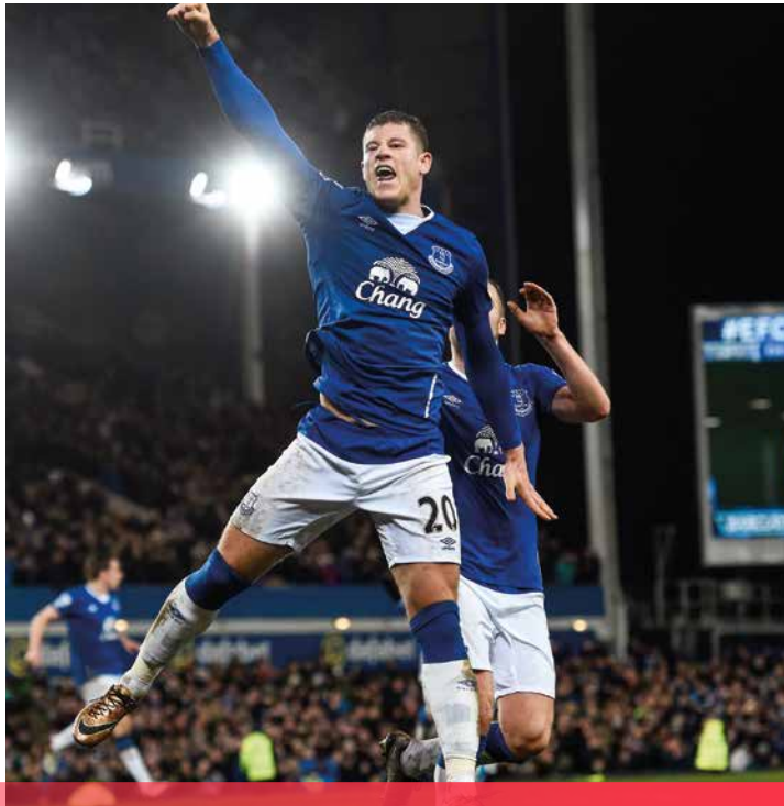
Professional Development Excelling in an elite environment