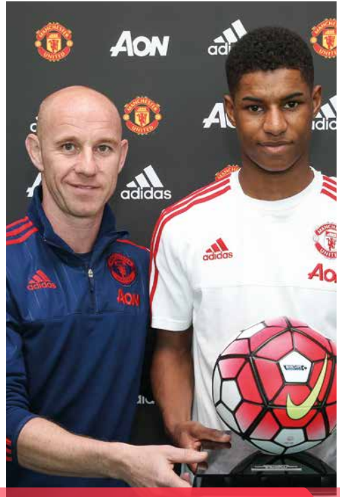
Youth Development Coaching for progress